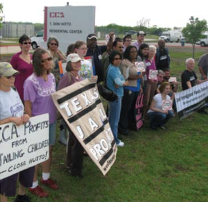
Grassroots Leadership Board, staff, and friends protest outside of the T. Don Hutto family detention facility.