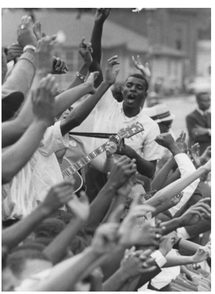
We recognize the power of the arts in transforming society.

Grassroots Leadership would like to give special thanks to CrossCurrents, a new foundation that works at the intersection of art and social justice, for helping support the Standing for Justice 1980-2040 national tour. CrossCurrents instigates collaborations with other funders and artists who are organizing to strengthen our democracy.