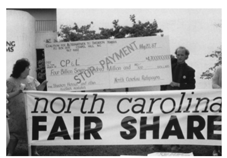
North Carolina Fair Share is one of the many organizations birthed by Grassroots Leadership