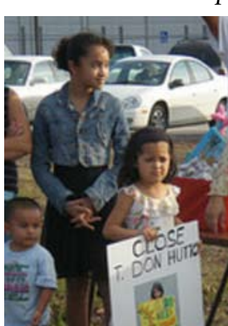
Grassroots Leadership helped close Hutto.

Their leadership has played an indispensible role in pushing back against the expansion of the prison and jail infrastructure in Texas. In late 2007 we received a call about a proposed private, faith-based contract prison facility in East Texas. Grassroots Leadership helped coach a local activ-